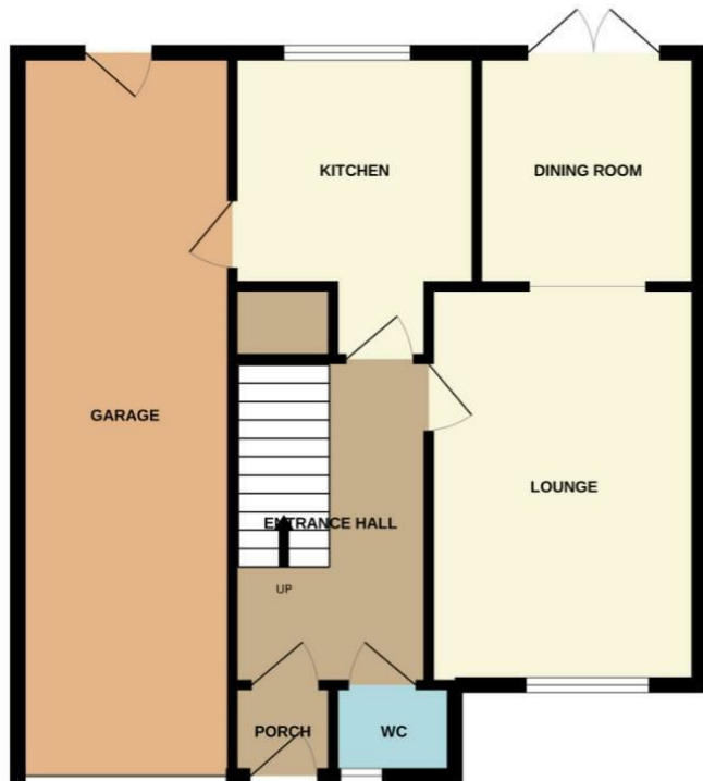
GROUND FLOOR 662 sq.ft. (61.5 sq.m.) approx.